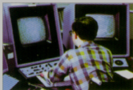
Control is by an advanced PLC - programmable logic controller